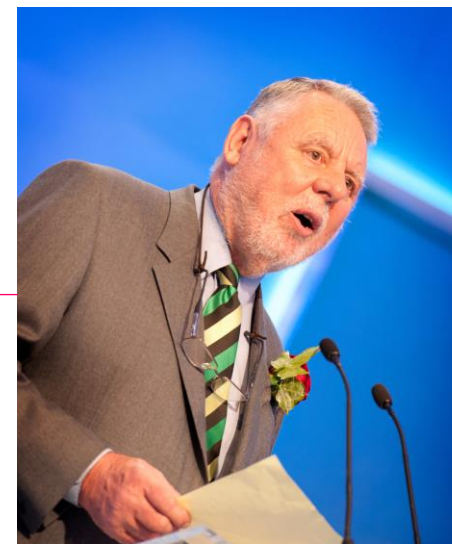
Cydweithio Working Together