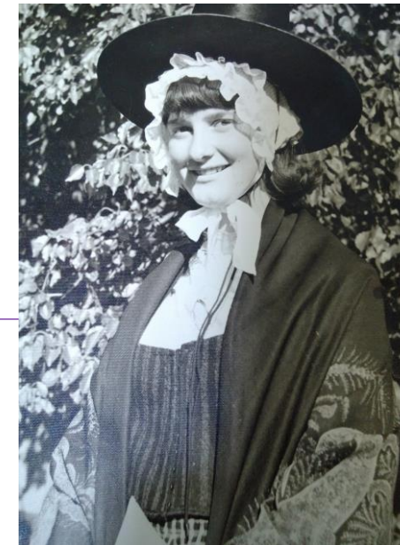
Ysbrydoli Cenedlethau'r Dyfodol Inspiring Future Generations

by tweeting @WalesforPeace #LlangollenPeaceMessage