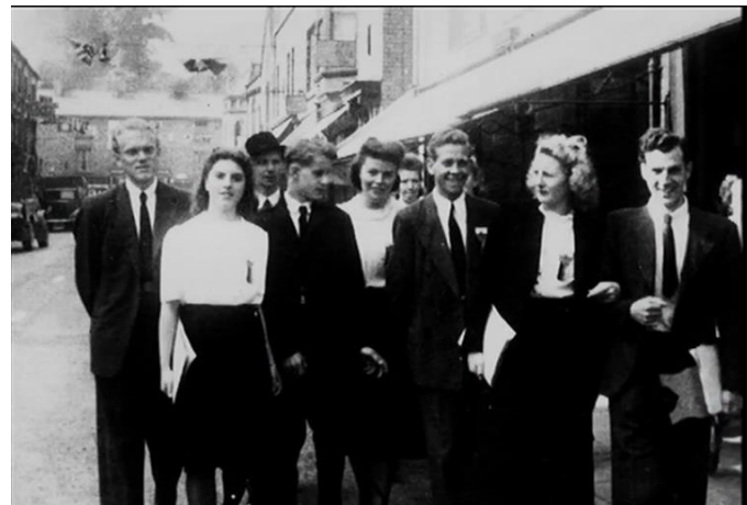
Cydsefyll Building Solidarity